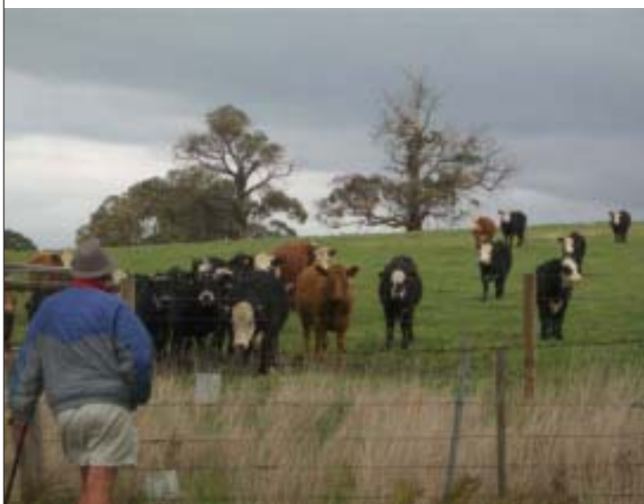
Last year the editor looked after a small farm in Victoria's lush Gippsland region. Among his charges were two cats and 40 cattle